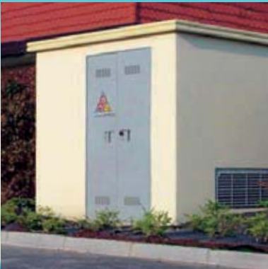
PREFABRICATED ELECTRICITY SUBSTATIONS

Electricity and natural gas are our light and air and for them we build prefabricated stations with low environmental impact.