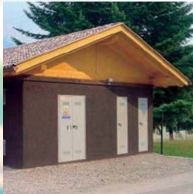
SOLUTIONS FOR ENVIRONMENT