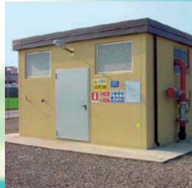
DECOMPRESSION CHAMBERS FOR NATURAL GAS